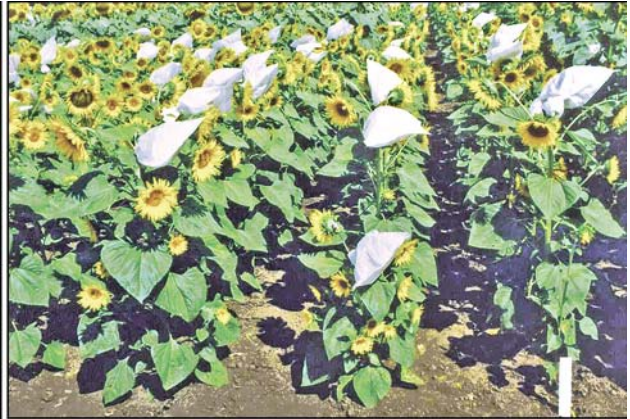
Figure 2: Fertility restorer line R 12003