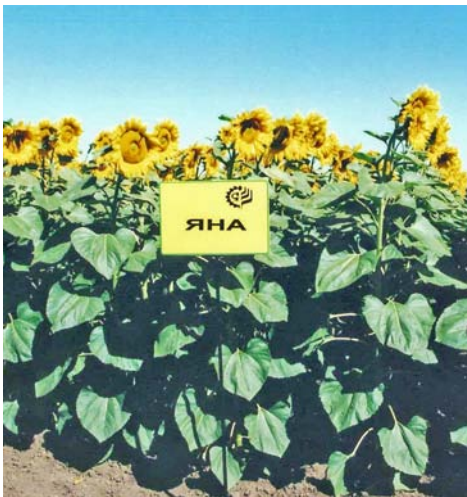
Figure 3: Hybrid Yana developed by the cross A 2607 × R 12003.

The 3 years testing of line R 12003 showed 100% restoration ability and very good combining ability. The sterile analogue of the Bulgarian selfed line A 2607 was used for a tester. A two factor dispersion analysis of hybrid Yana-Figure 3 (simple cross ms2607 × R 12003) was carried out with regard to the main indices seed yield (kg/dka) and 1000 seed weight (g).