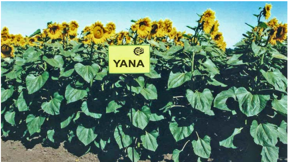
Figure 10: Hybrid "Yana" developed from the crossing 2607 A × 12003 R

Prograin Genetique. The hybrid considerably exceeded the average standard of seed yield (French commercial hybrids Prodisol, Allstar and Melody) by 3%.