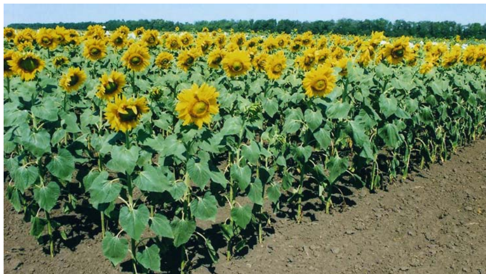
Figure 8: Hybrid "Goryanin" developed from the crossing 4558 A \times 12004 R

After long individual selection mutant lines 12002 R, 12003 R and 12004 R were developed and tested for their combining abilities. The results from three-year testing of lines 12002 R, 12003 R and 12004 R revealed very good combining abilities in hybridization. The line 2607 A and 4558 A (sterile analogues of the Bulgarian inbred lines) were used as a tester.