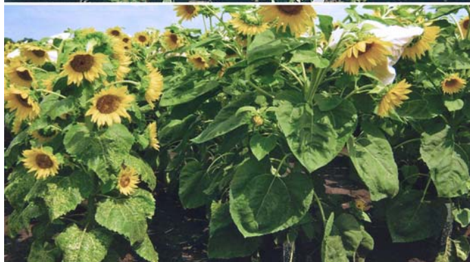
Figure 3: Genotype 2571 R (left) and mutant line 171 R (right)

After treating the line 2571 R with ultra sounds at the dose of 25.5 \text{ W/cm}^2 for 30 min, the mutant line 171 R (Figure 3) was produced. It was characterised by the increased plant height (19.7 cm), increased length of branches (7.3 cm), increased mean value of other morphological characters (Encheva et al. , 2012a).