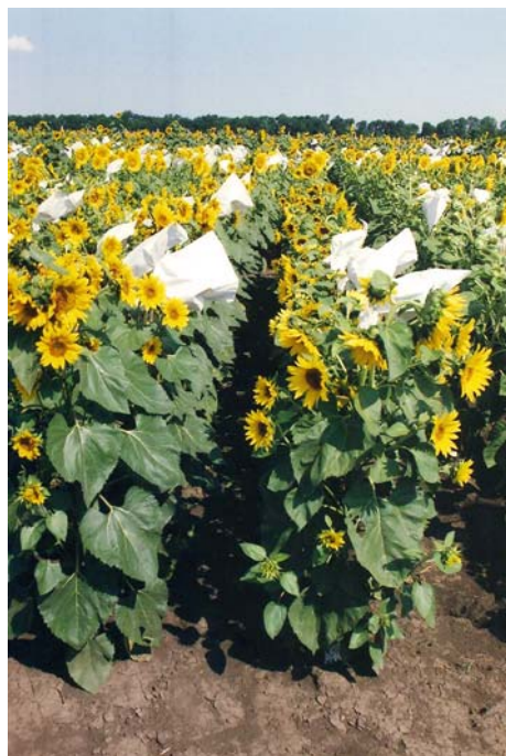
Figure 1: Genotype RHA-857 R (left) and mutant line 106 R (right)

were developed (Table 1). Mutant lines were selected due to their statistically significant morphological and biochemical changes.