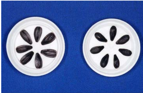
Figure 4: Seed size and seed coat color of line RHA-857 R (left) and mutant line 106 R (right)

observed as well (Figure 4). Seeds coat of new line were different by their black color, while at the control RHA-857 seeds coat were black with gray stripes in both marginal and lateral (Encheva, 2009b).