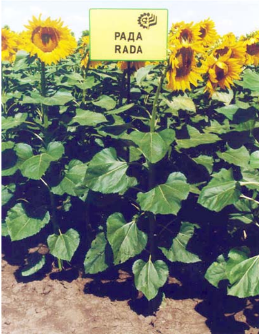
Figure 9: Hybrid "Rada" developed from the crossing 2607 A × 12002 R

Hybrid Rada considerably exceeded the average standard of seed yield (the Bulgarian commercial hybrid Albena and French commercial hybrid Diabolo) by 2.3-7.2%.