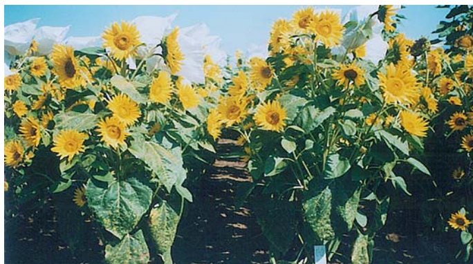
Figure 2: Mutant lines 99 R and 100 R

Lines 97 R, 99 R (Figure 2), 100 R (Figure 2) and 101 R, developed after treating the control line 381 R with ultra sounds at the dose of 25.5 \text{ W/cm}^2 for 1 min and line 98 R for 3 min showed increased plant height (6.5 cm to 23.3 cm), decreased length of branches (12.5 cm), decreased leaf size, increased number of branches with 11 and e. ts. (Encheva and Shindrova, 2011).