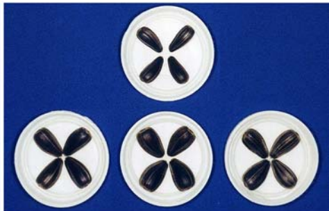
Figure 7: Seed size of line 197 B (above) and mutant lines 74 B, 78 B and 88 B (down)

Seeds of mutant line 171 R were black with gray stripes, both marginal and lateral (Figure 5), while that of the donor line 2571 R were black. The new line differed by the increased width and length (Encheva et al. , 2012a). The mutant line 12003 R had black seeds with gray stripes, both marginal and lateral (Figure 6), while the donor line 147 R had black color (Encheva et al. , 2012b). Line 116 R, 118 R and 120 R had black seed color, and lines 117 R and 119 R - brownish seed color. The genotype 147 R had seeds with black color and gray stripes, both marginal and lateral. The mutant lines did not have stripes (Encheva et al. , 2008).