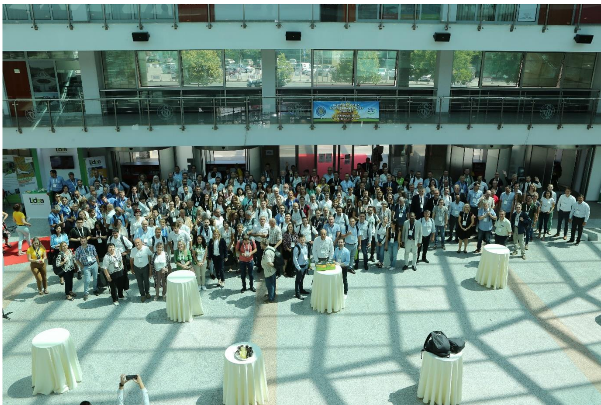
June 20 th , the traditional picture of the conference delegates.