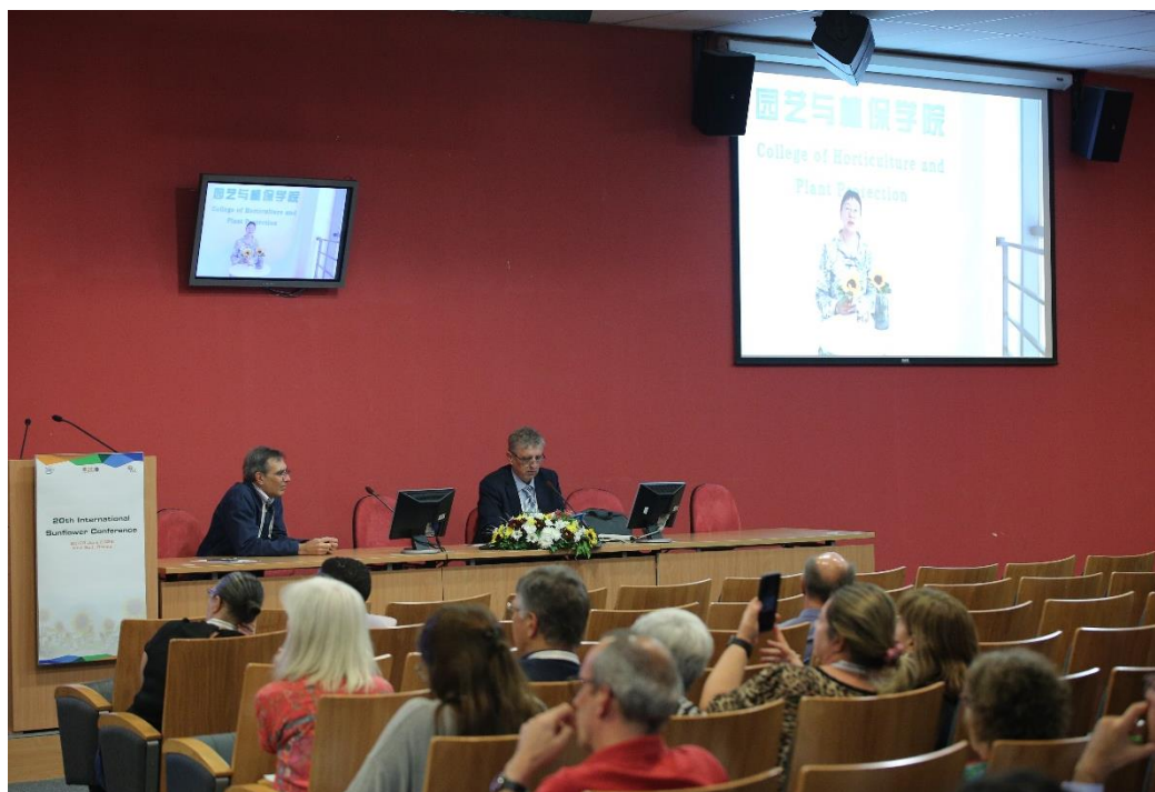
End of ISA general Assembly, video invitation to the next ISC in China Inner Mongolia in 2024.

At the end of the General Assembly, a video presentation by Prof Zhao Jun invited all to the next Sunflower Conference in China Inner Mongolia, in 2024.