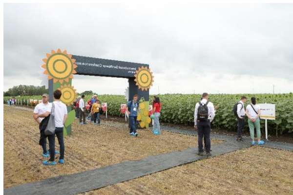
Field Day at IFVC-NS: traditional welcome with bread and salt // Field visit with overshoes and clean carpets after a very rainy night...